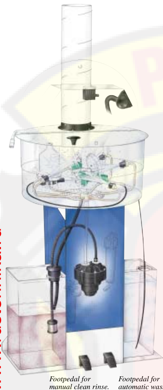
Footpedal for manual clean rinse. Footpedal for automatic washing.